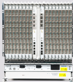
7360 ISAM FX-16