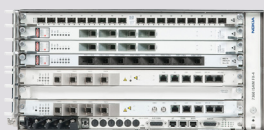
7360 ISAM FX-4